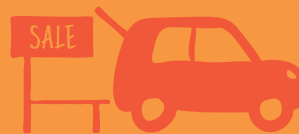
CAR BOOT SALE